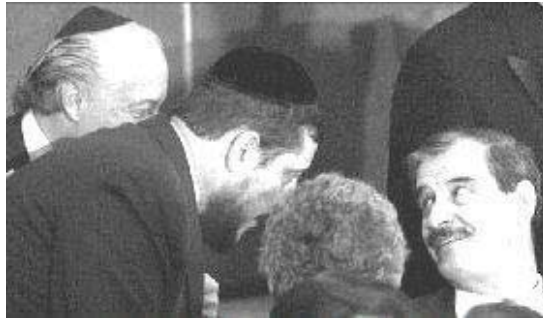
Mexico - President Vicente Fox